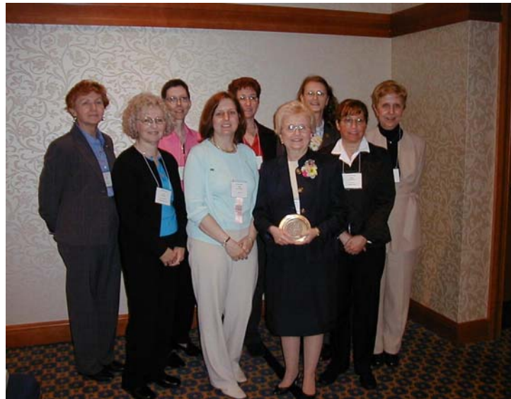
NEDA members at the presentation